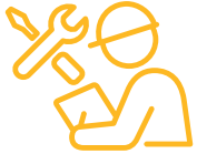
Accidental damage and repair

Gold provides coverage above and beyond our new product warranty to ensure you get the most out of your investment.