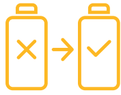
Replacement of damaged accessories