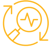
Annual tool inspection, calibration, cleaning, and updating