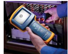
End-face inspection, using either a handheld optical or video microscope (shown here), should be done both during and after termination to check for contaminated or improperly polished connector end-faces.

Video microscopes incorporate both an optical probe and a display for viewing the probe’s image. Probes are designed to be small so that they can reach ports in hard-to-access places. The screens allow images to be expanded for easier identification of contaminants and damage. Because the end-face is viewed on a screen instead of directly, probes eliminate any chance of harmful laser light from reaching a person’s eye.