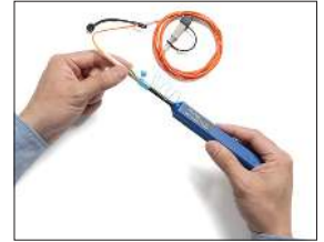
Newly developed dry cleaning tool provides an economical and easy way to remove contaminants from fiber end-faces.

There are a wide variety of tools available to clean end-faces. The most basic tools are wipes and swabs used to clean patch cords and inside ports, respectively. More involved approaches include mechanical, hand-held contraptions designed to make easier work of cleaning. (e.g. the IBC OneClick cleaners) The most complex devices incorporate blasted solvents or ultrasound in water to achieve the best result. While the more complex systems may achieve better results, they cost far more money. Individuals should determine the best approach for their application and budget. The one key criterion for wiping materials is that they be lint-free. Shirt sleeves are unacceptable!