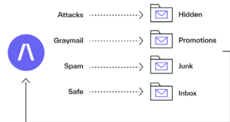
Automatically Learns from User Actions

The platform learns each user's preference as they move emails between folders within their mailbox. This personalized understanding enables Abnormal to deliver incoming emails directly into the folder, giving end users an immersive email experience.