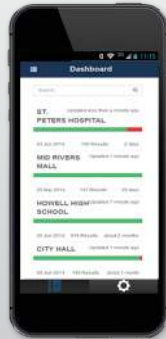
LinkWare Live SmartPhone Interface