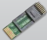
Example of a test plug using a PCB substrate