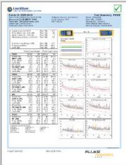
LinkWare PC Report