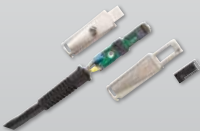
DSX-PLA004 Permanent Link Adapter

As indicated in the standard, crimping an RJ45 plug onto a patch cord to make a test lead results in unpredictable performance. The removable test plug referenced as an option in the TIA-568-C.2 and ISO/IEC 61935-1 is found on the end of the DSX-PLA004 Permanent Link Adapter. Every tip is fully compliant for NEXT, FEXT and Return Loss.