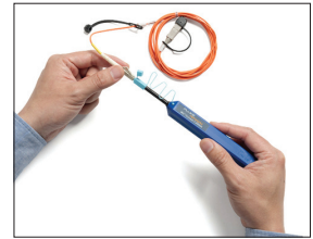
Newly developed dry cleaning tool provides an economical and easy way to remove contaminants from fiber end-faces.

There are a wide variety of tools available to clean end-faces. The most basic tools are wipes and swabs used to clean patch cords and inside ports, respectively. More involved approaches include mechanical, hand-held contraptions designed to make easier work of cleaning. (e.g. the IBC OneClick cleaners) The most complex devices incorporate blasted solvents or ultrasound in water to achieve the best result. While the more complex systems may achieve better results, they cost far more money. Individuals should determine the best approach for their application and budget. The one key criterion for wiping materials is that they be lint-free. Shirt sleeves are unacceptable!