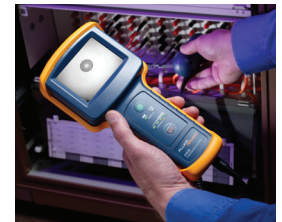
End-face inspection, using either a handheld optical or video microscope (shown here), should be done both during and after termination to check for contaminated or improperly polished connector end-faces.

Video microscopes incorporate both an optical probe and a display for viewing the probe’s image. Probes are designed to be small so that they can reach ports in hard-to-access places. The screens allow images to be expanded for easier identification of contaminants and damage. Because the end-face is viewed on a screen instead of directly, probes eliminate any chance of harmful laser light from reaching a person’s eye.