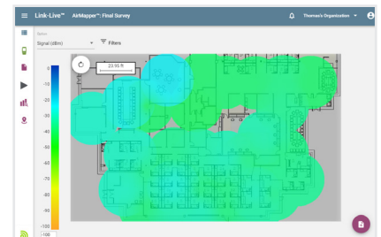
Share and visualize survey data through cloud-based Link-Live Service.