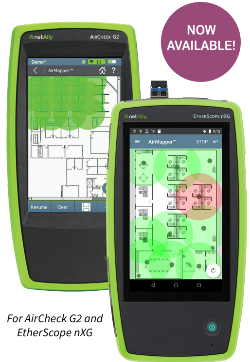
For AirCheck G2 and EtherScope nXG

With the cloud-based Link-Live service or AirMagnet Survey PRO creating powerful visualizations of the recorded data, centralized engineers can analyze test results from far-flung remote sites without travel.