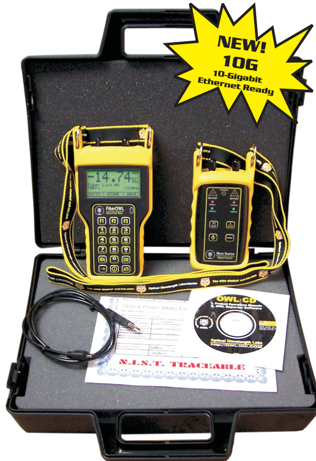
Connector styles or placement may vary from photo